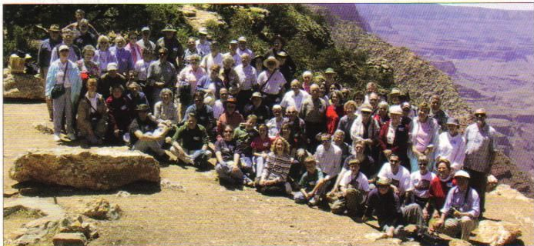
Grand Canyon 2004 Tour Group poses near the edge.

One hundred and eleven participants in the 2004 Grand Canyon Tour returned mostly unscathed from two weeks in the Canyon in May. Two groups of thirty rafters each challenged the upper and lower reaches of the Colorado River, ten hikers ventured into Havasupai Canyon, and forty-five intrepid bus participants explored Grand Canyon and the surrounding Parks.